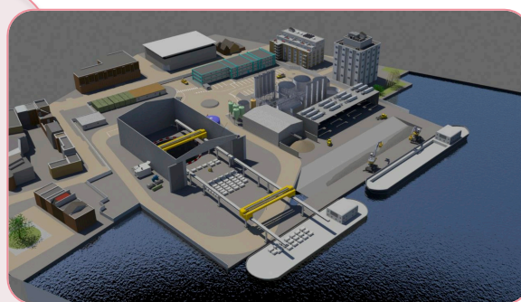
Image: Site Layout, from Chambers Wharf Community Liaison Working Group Presentation, March 2016